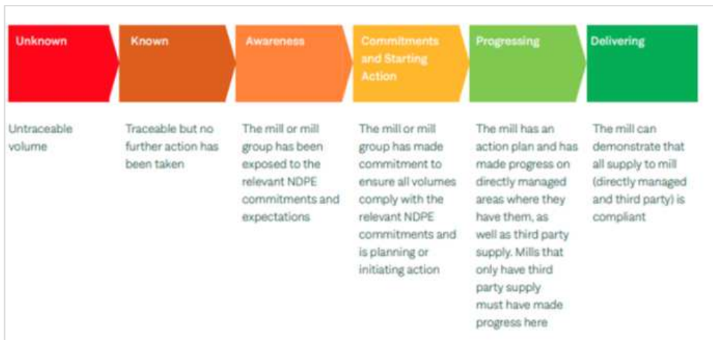
Figure 1 - Categories of progress for supply chain volumes form palm oil in the implementation Reporting Framework

The No-deforestation, No-peat and No-exploitation (NDPE) Implementation Reporting Framework, known as NDPE IRF, is a reporting tool designed to help companies to systematically understand and track progress in delivering NDPE commitments in their palm oil supply chains. In the Figure 1 picture you can observe categories of progress for supply chain volumes form palm oil in the implementation Reporting Framework.